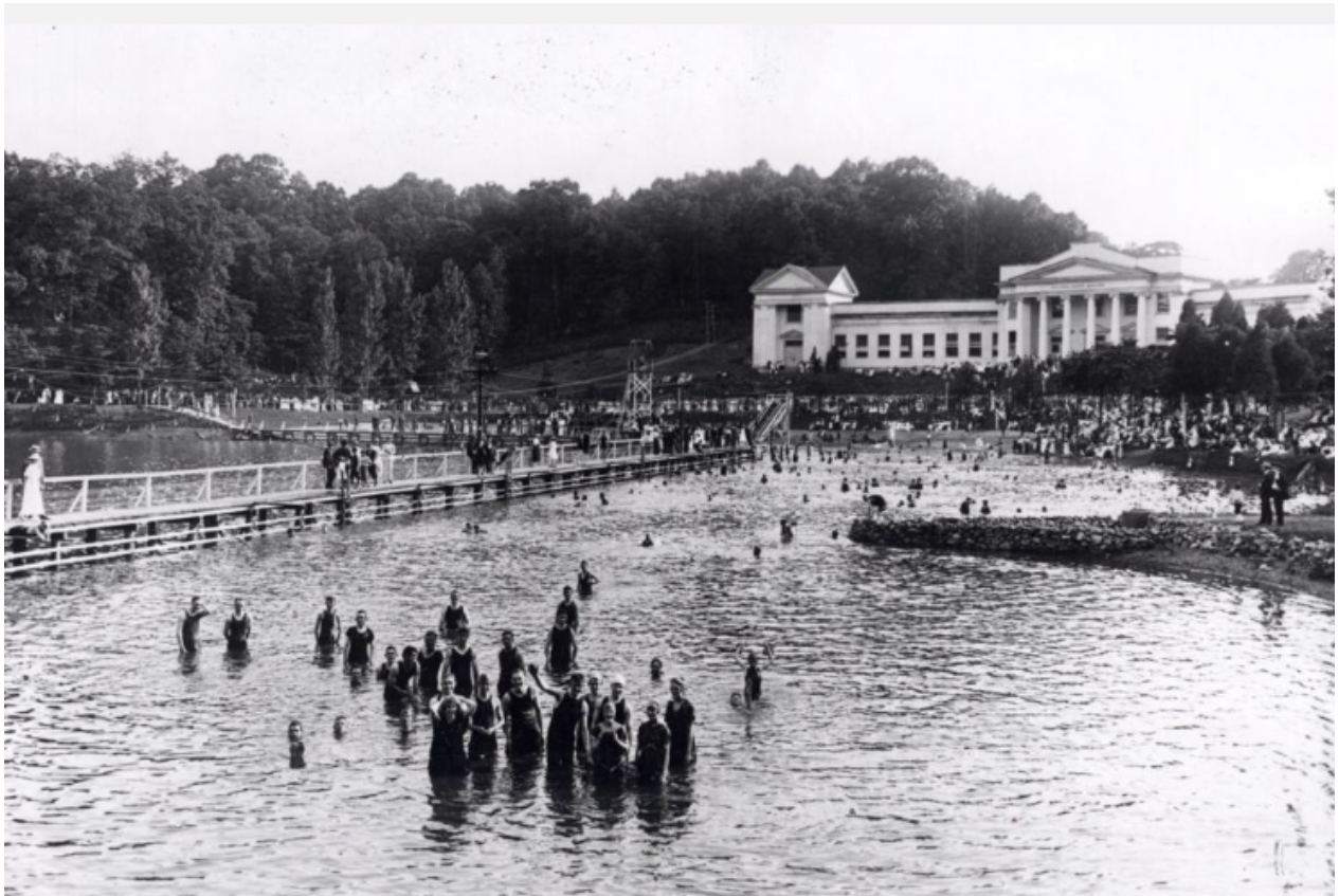
Swimmers in Chilhowee Park's lake in 1913.